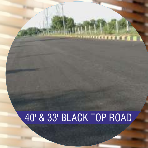
40' & 33' BLACK TOP ROAD