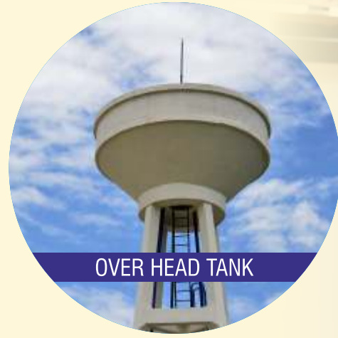
OVER HEAD TANK