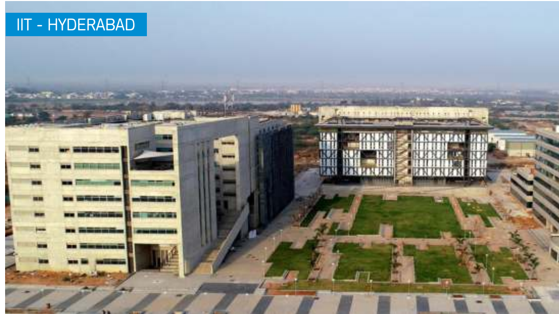
IIT - HYDERABAD