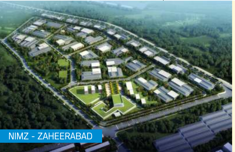
NIMZ - ZAHEERABAD