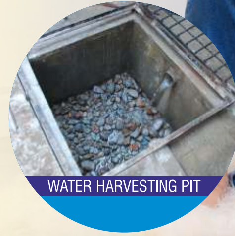
WATER HARVESTING PIT