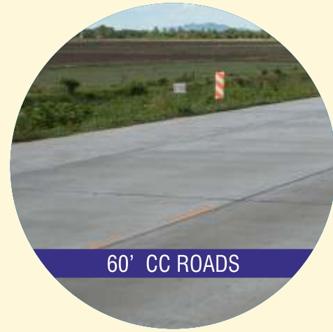
60' CC ROADS