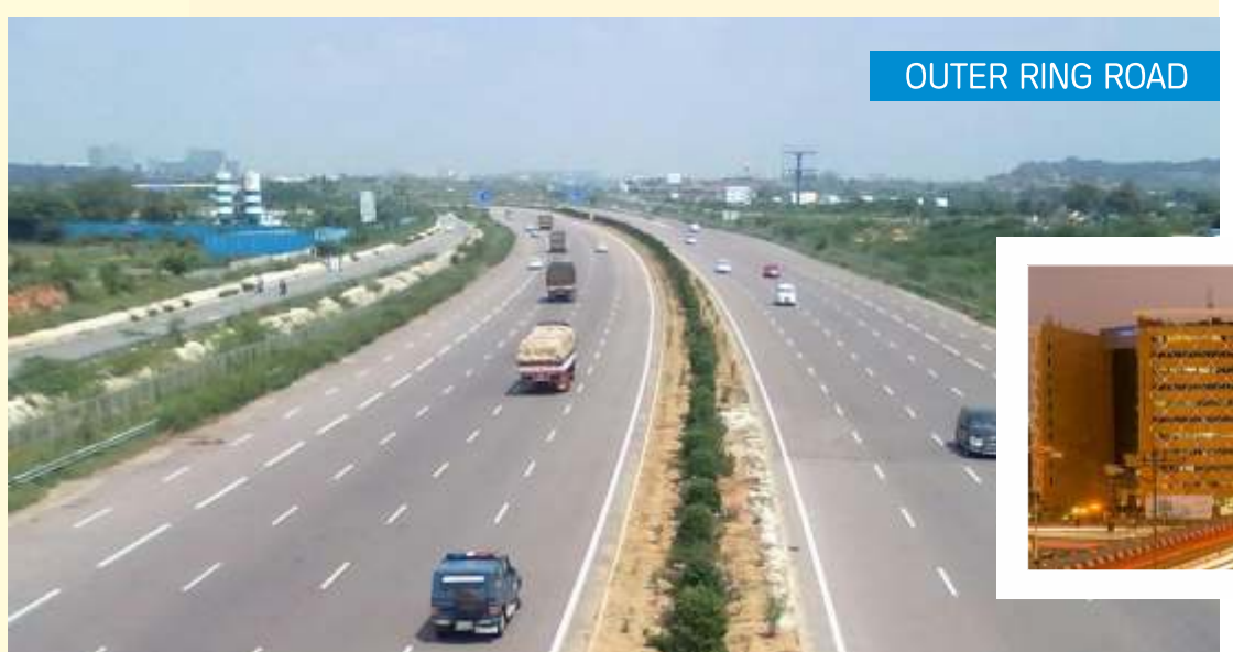
OUTER RING ROAD