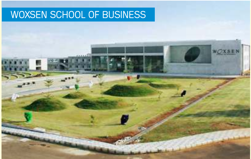
WOXSEN SCHOOL OF BUSINESS