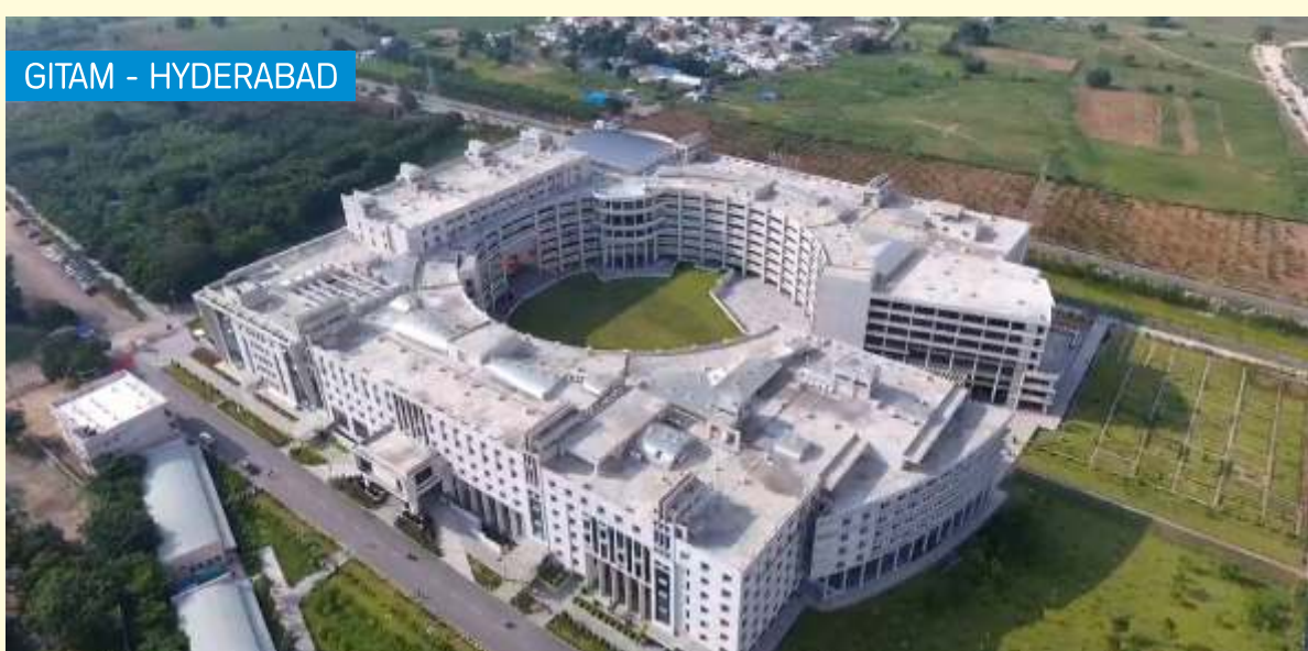
GITAM - HYDERABAD