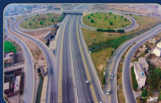
Regional Ring Road - 10 Mins