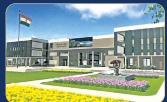
RR Dist. Collector Office - 25 Mins