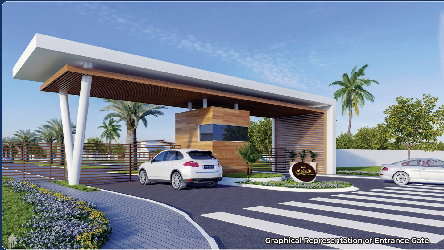
Graphical Representation of Entrance Gate