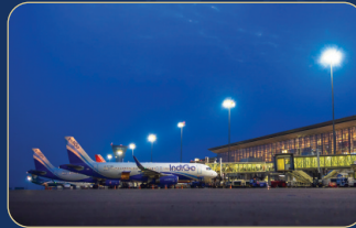
RGIA - 30 Mins