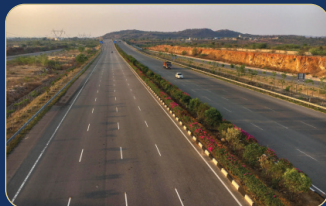
ORR (Tukkuguda) - 20 Mins