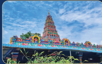
Maisigandi Temple - 5 Mins