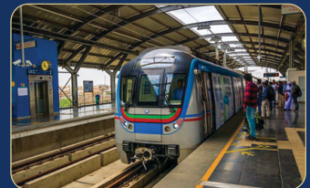
Metro LB Nagar - 55 Mins