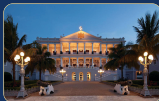
Falaknuma - 40 Mins