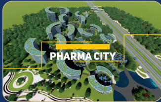
Pharma City - 2 Mins