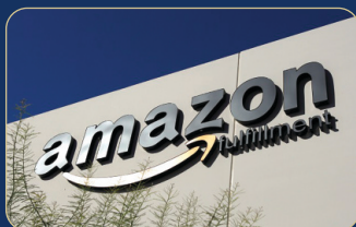
Amazon - 15 Mins