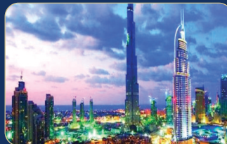
Fab City - 15 Mins