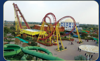
Wonderla - 25 Mins