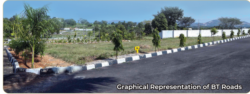
Graphical Representation of BT Roads