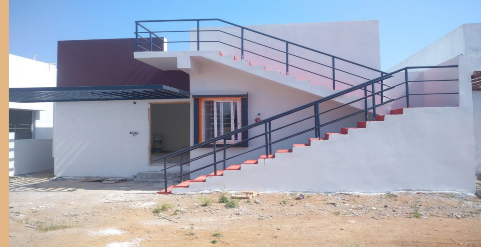
WEST FACING VILLA FRONT VIEW

మధ్య తరగతి ప్రజల కలల సాధాలు ముస్తాబవుతున్నాయి